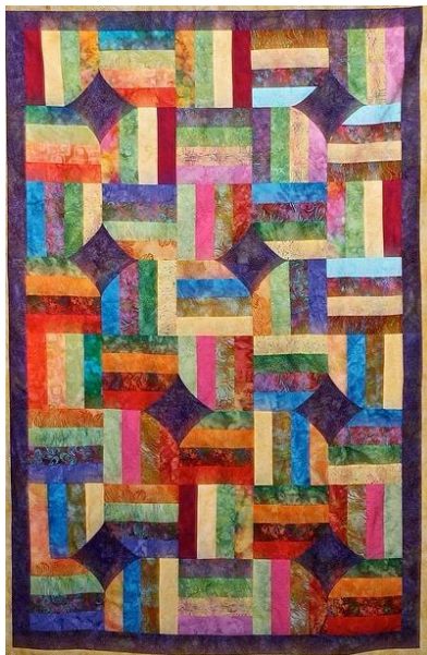
Single Diamond (uses large corner triangles only)