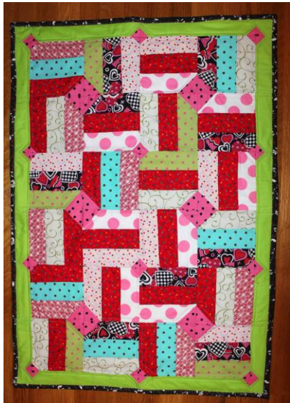
Double Diamond Rail Fence