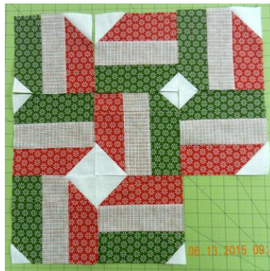
Eight blocks: the larger corner triangles form a large accent diamond, and the smaller ones create smaller accent diamonds