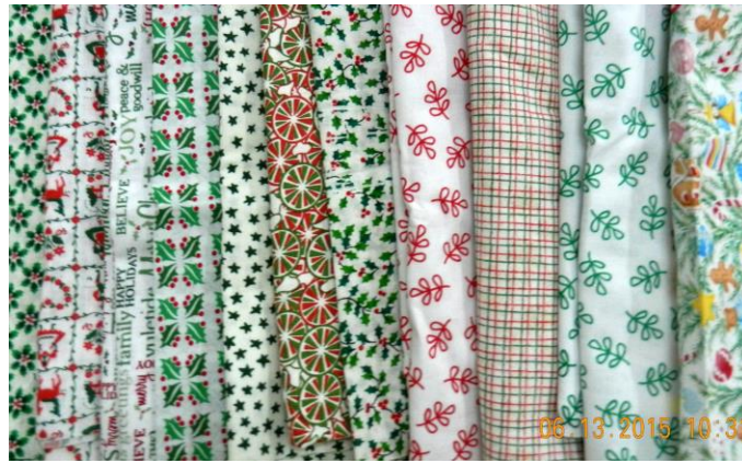
All these work for the center strip